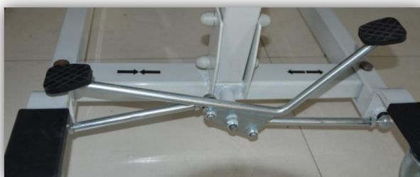
Adjustable foot pedal